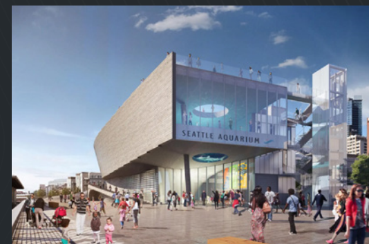
A rendering of Turner's Seattle Aquarium project