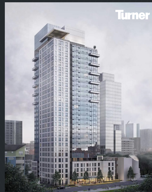
Rendering of Turner's Waverly project.

While Tekla Structures brings tremendous value for large, complex projects, we still use SketchUp when we need a fast, lightweight tool for immediate field issues or early planning where the power of Tekla Structures isn't required."