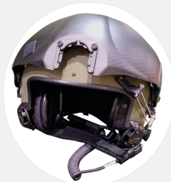
Available for any fixed wing and rotary wing aircraft