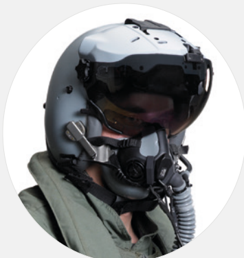
Insta ANR fits directly to HGU-55 style helmets

*Variations subject to person and fitment