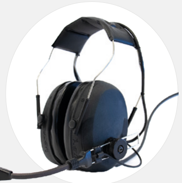
Headset applications for ground crew and civil aviation