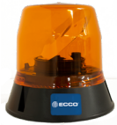
EB7813A LED Rotating Beacon