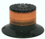
EB7265A Simulate Rotate Quad Burst