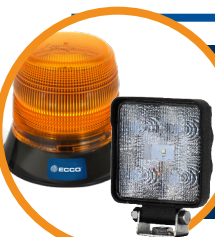
V11050 + WL5094 700 Lumen Flood Beam Worklight