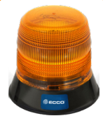
V11050 LED Simulate Rotate