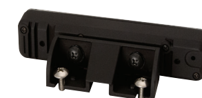
Tilt Bracket / Self-Adhesive