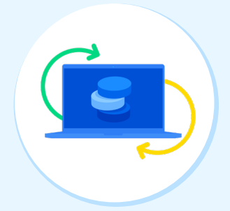
Install from the Contentful Marketplace