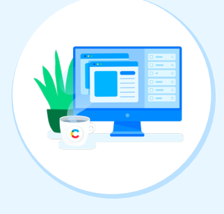
Review and publish translations