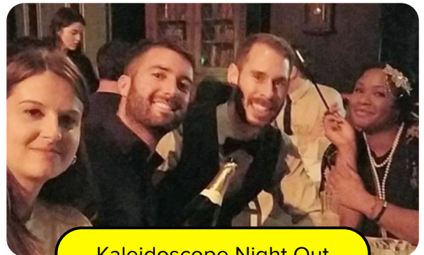
Kaleidoscope Night Out