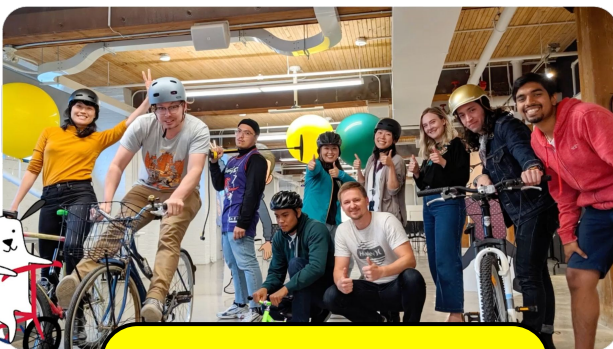
Kaleidoscope Bike Ride

Kaleidoscope aims to provide employees in offices outside of LA the opportunity to build a grassroots foundation for diversity and inclusion, unique to their local office culture.