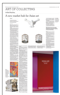
The Art of Collecting