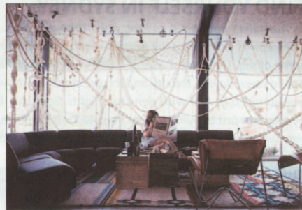
ON A STRING: The lobby is decorated with a free-form curtain of fisherman's nets, sailors' knots, pulleys and hooks.