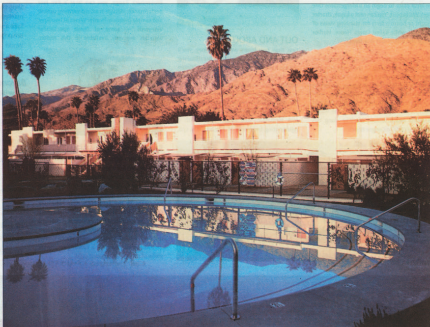
Ace Hotel

THAT 1960s VIBE: A former Howard Johnson's complex has been thoroughly made over as the Ace Hotel & Swim Club. Community and interaction are big — at poolside or at seven outdoor living rooms with fireplaces. There are two big saltwater pools, a spa and a dog park.