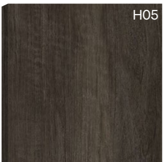
Smoked Marvel Walnut