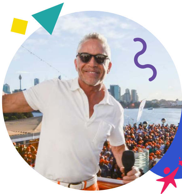
Dave Koz & Fans