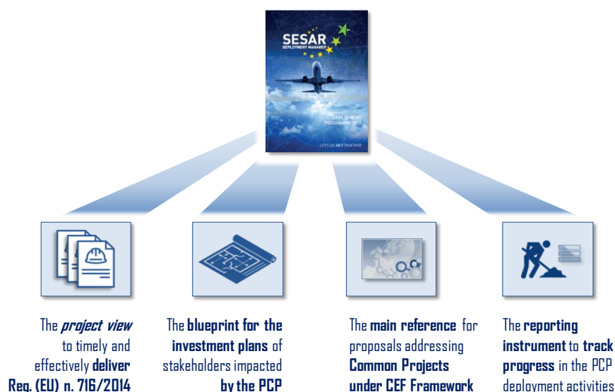
Fig. 7 – The role of the SESAR Deployment Programme

Through the Deployment Programme, all ATM Stakeholders are provided with a common reference to support the optimization and synchronization of their investments within the scope of the Pilot Common Project. More specifically, the Programme flags implementation activities to be performed, identifies the optimum timing for such implementation and supports the definition of the most suitable approach in order to achieve the objectives set forth in the Regulation .