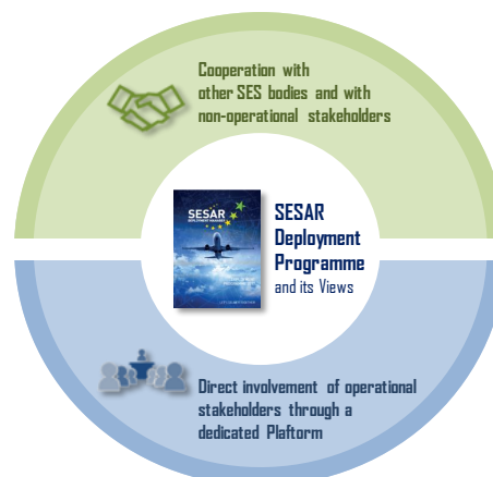
Fig. 9 - Main fields of Stakeholders' consultation