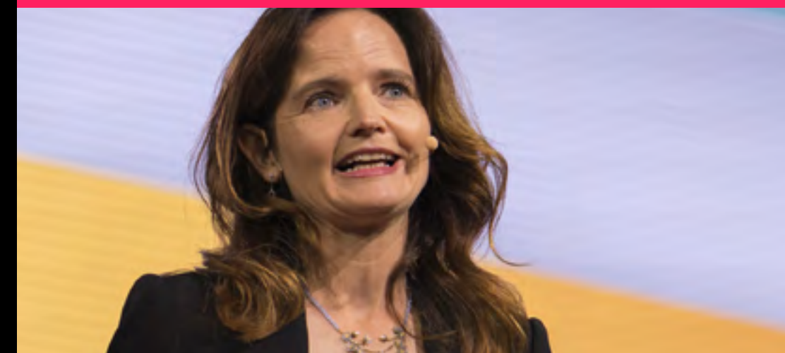
CHARLOTTE HOGG Visa Europe (spoke in 2018)