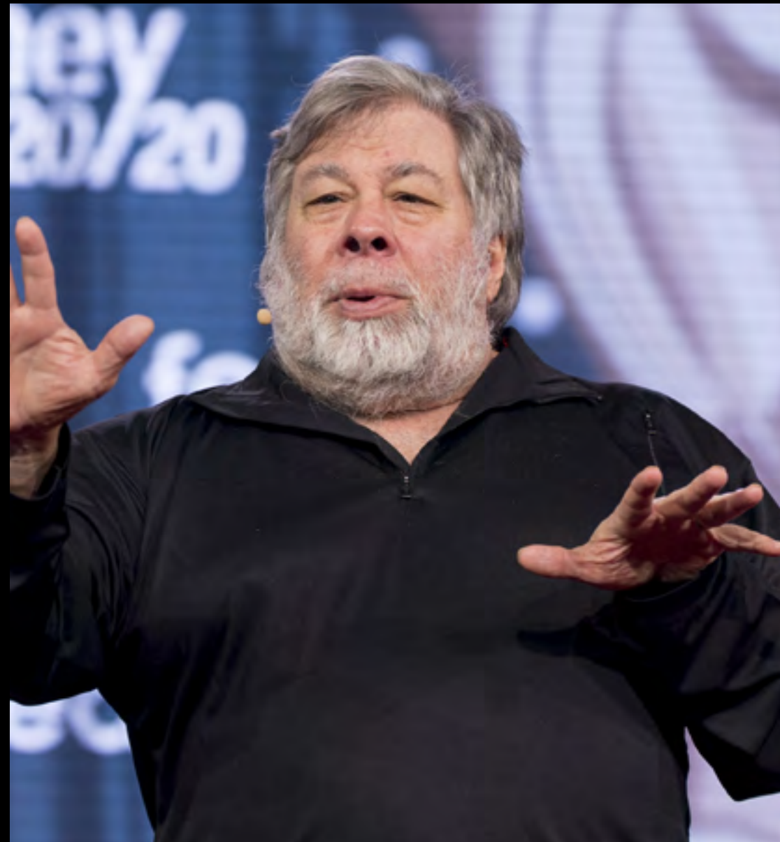
STEVE WOZNIAK Co-Founder, Apple

In 2020, the Money20/20 team didn't get much of a chance to do what we're good at and what we love to do: run game-changing events that bring together the global fintech community and help it move forward.