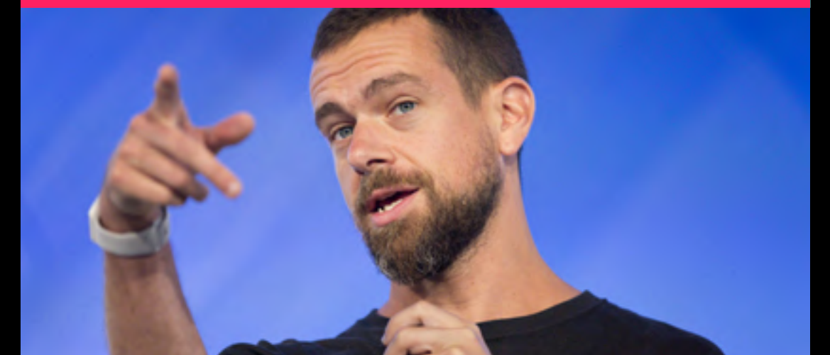
JACK DORSEY Square (spoke in 2017)