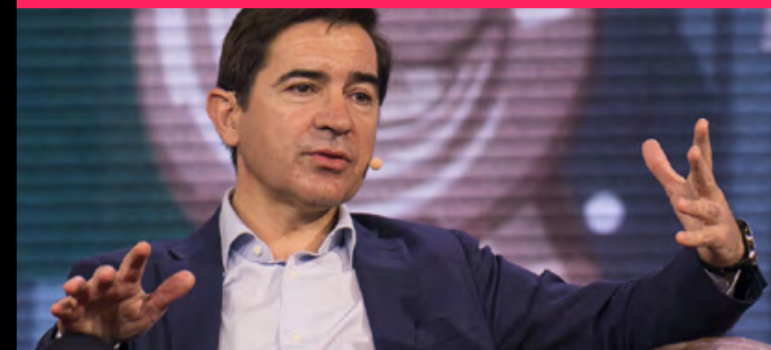
CARLOS TORRES VILA BBVA (spoke in 2018)