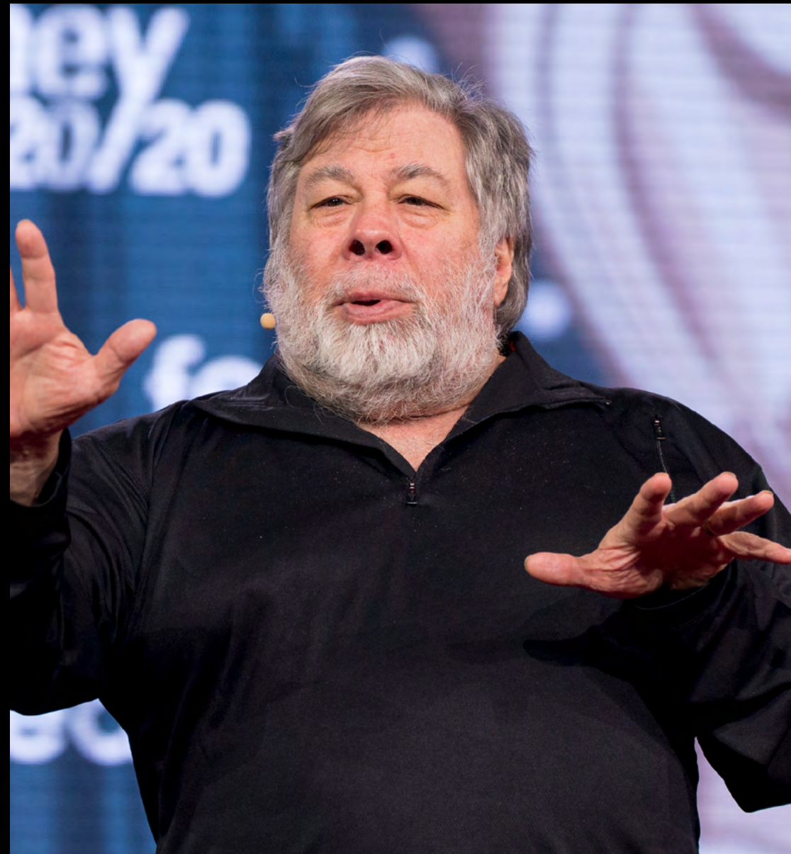
STEVE WOZNIAK Co-Founder, Apple

In 2020, the Money20/20 team didn't get much of a chance to do what we're good at and what we love to do: run game-changing events that bring together the global fintech community and help it move forward.