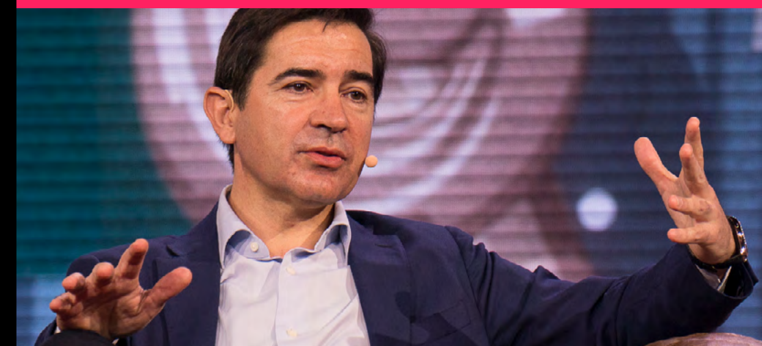
CARLOS TORRES VILA BBVA (spoke in 2018)