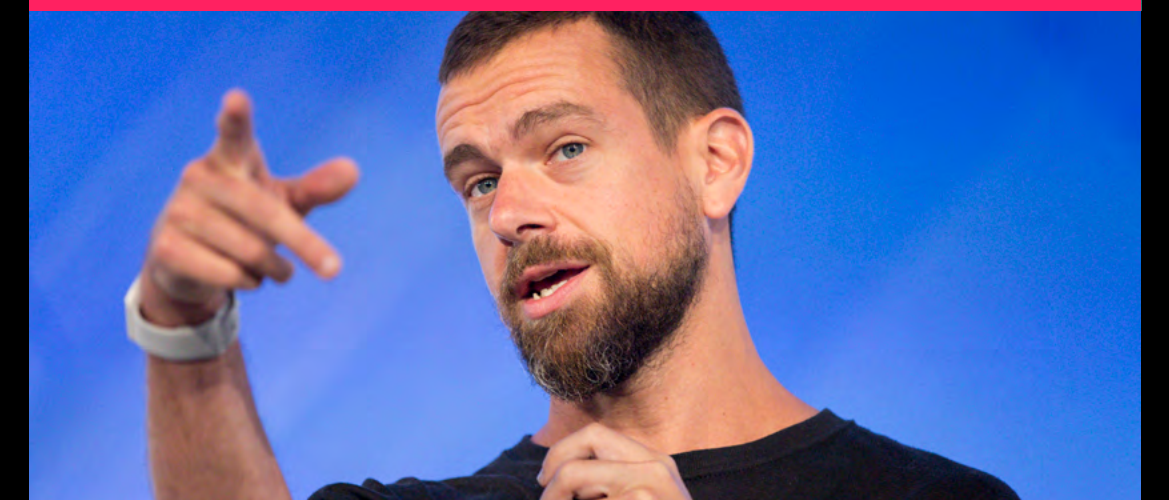
JACK DORSEY Square (spoke in 2017)