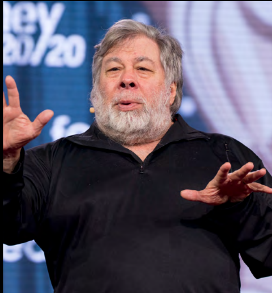
STEVE WOZNIAK Co-Founder, Apple

In 2020, the Money20/20 team didn't get much of a chance to do what we're good at and what we love to do: run game-changing events that bring together the global fintech community and help it move forward.