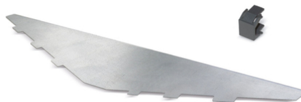
Top cover for patch panel KS 24x-a, angled Blank cover, black