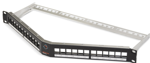
Shielded patch panel KS 24x-a, angled