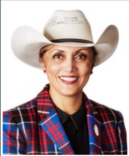
MAYOR JYOTI GONDEK