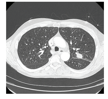
Fig 2. CT Scan

Biopsy Tools used MONARCH needle, forceps