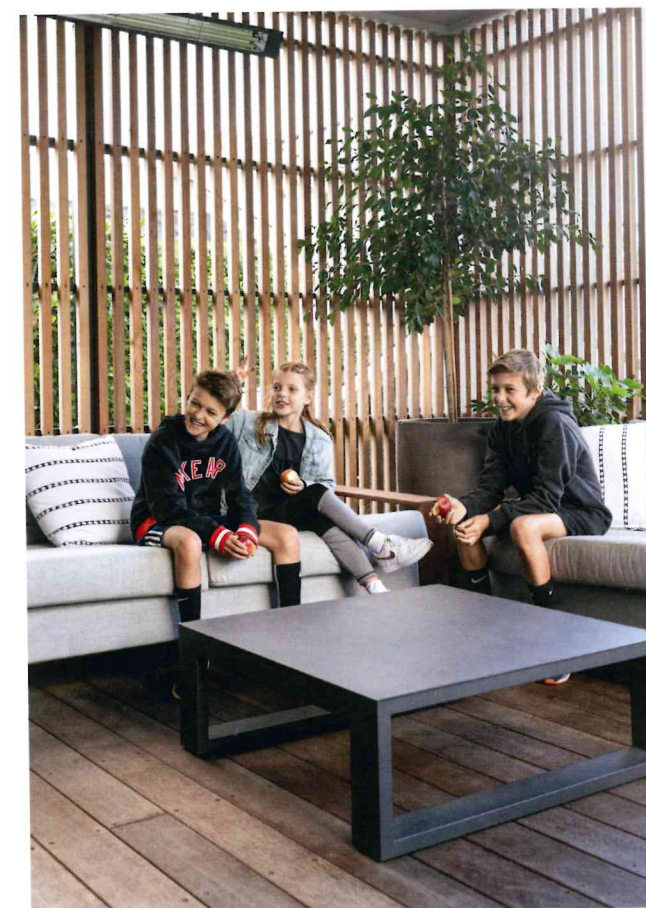
TOP Growing by the day, the ficus hedge behind the pool is almost tall enough to completely obscure the family's private section from a neighbouring block. ABOVE LEFT Seating from BoConcept creates a conversation zone in the informal living area with side tables by NED Collections and a standing lamp from May Time that echoes the pendant in the kitchen. ABOVE RIGHT The kids hang out on the deck on a sofa by Great Barrier Furniture. The coffee table is from Design Warehouse.