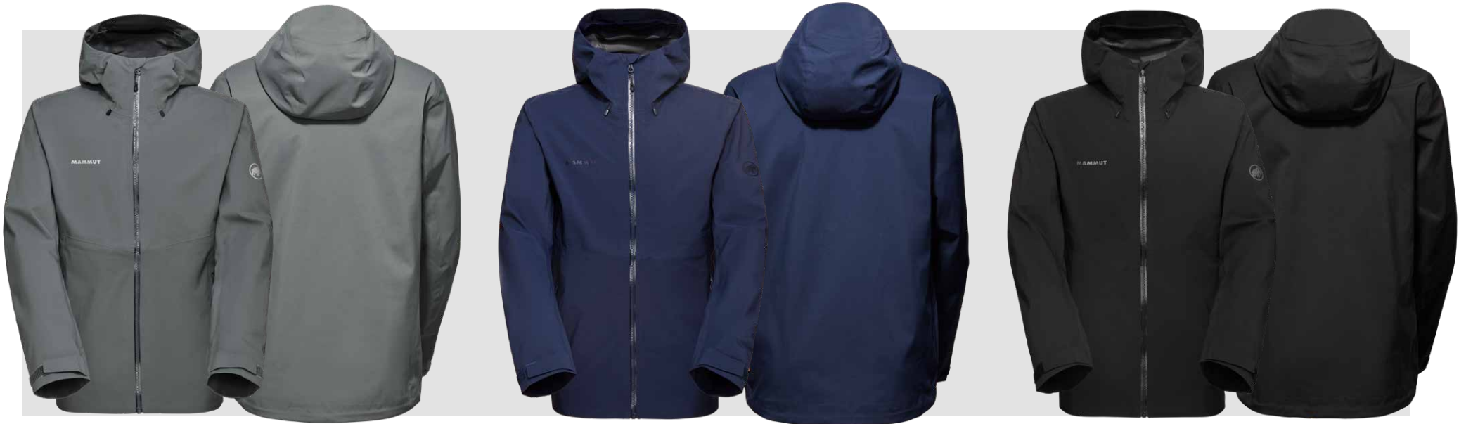
Corporate HS Hooded Jacket Men Steel 1010-30710-0226