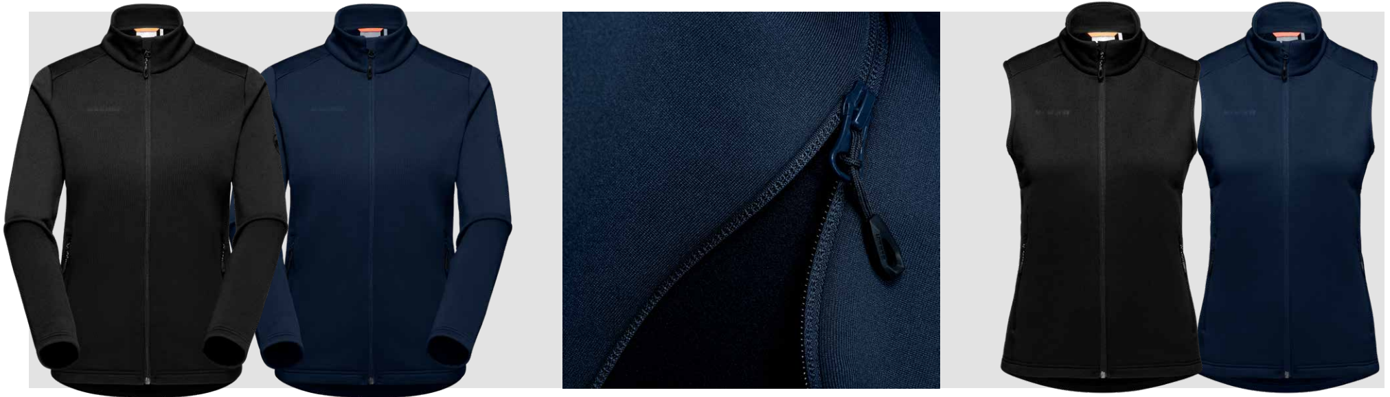
Corporate ML Jacket Women 1014-04730