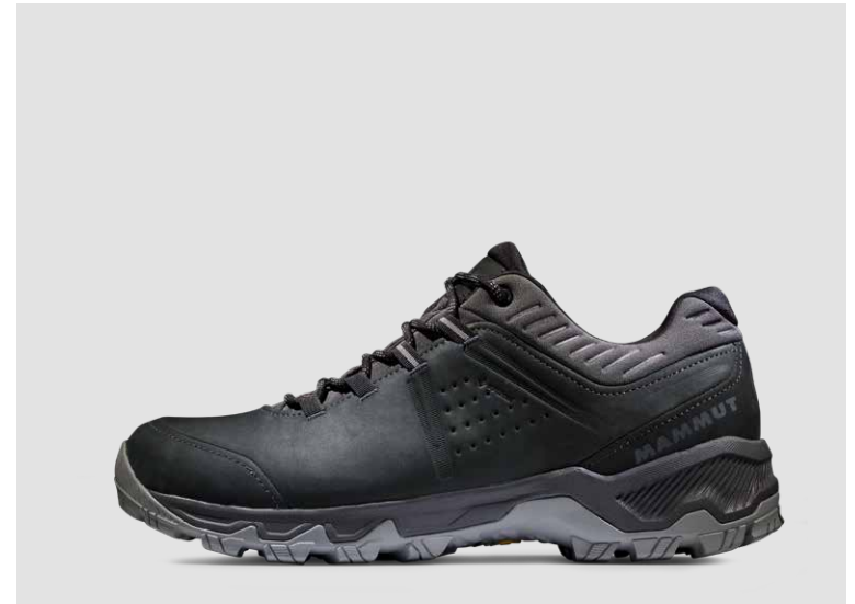
Mercury Low GTX Men 3030-04700