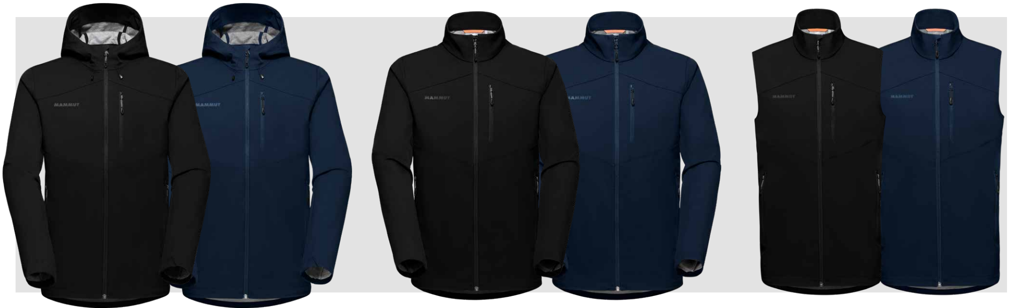
Corporate SO Hooded Jacket Men 1011-02070