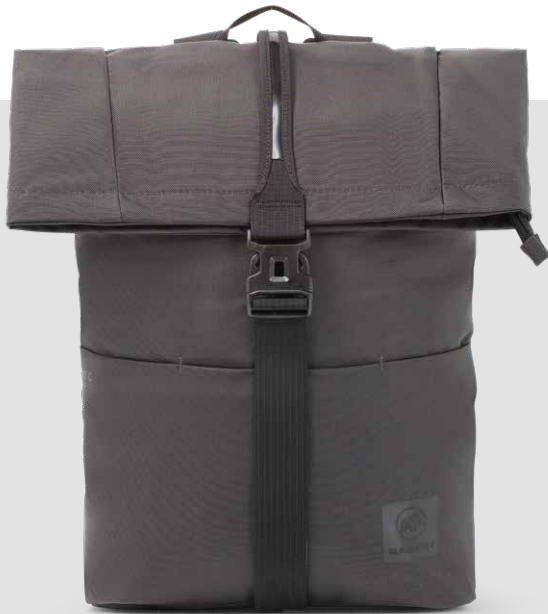
Corporate Xeron 15 2570-00060