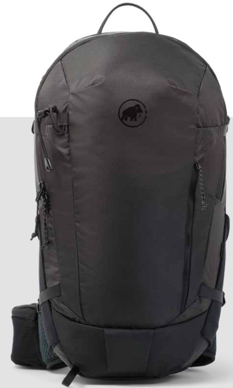
Corporate Lithium 20 2530-00940