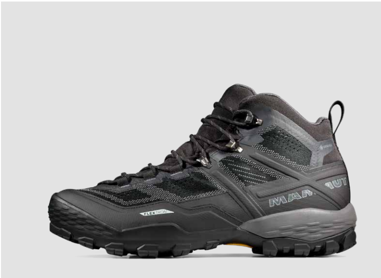
Ducan Mid GTX Men 3030-03541