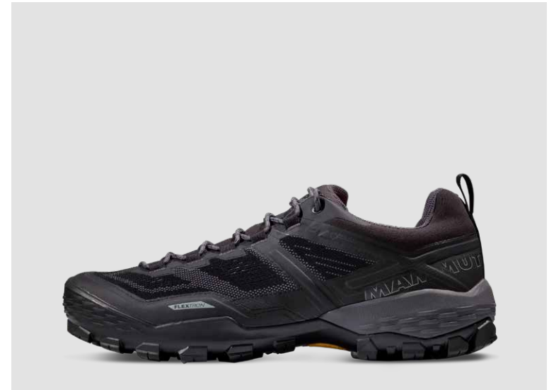
Ducan Low GTX Men 3030-03521