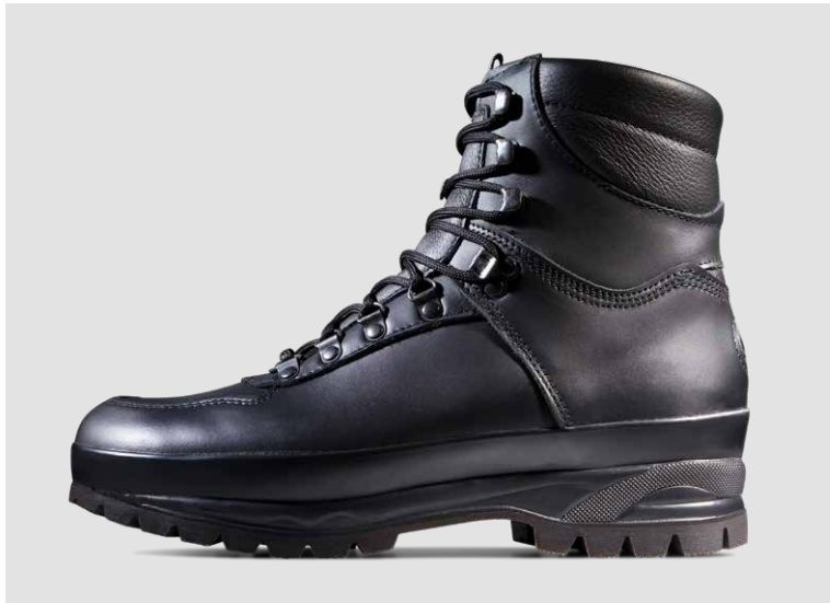
Colorado LTH 3020-04330