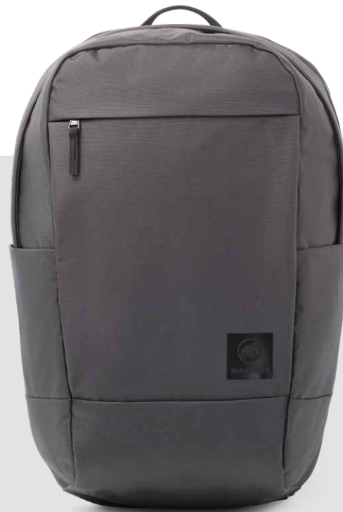
Corporate Xeron 25 2570-00070