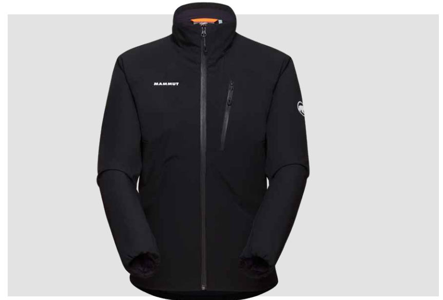
Mtn Pro 2.0 IN Jacket Women 1013-02900