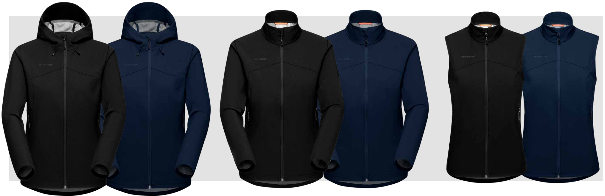
Corporate SO Hooded Jacket Women 1011-02080