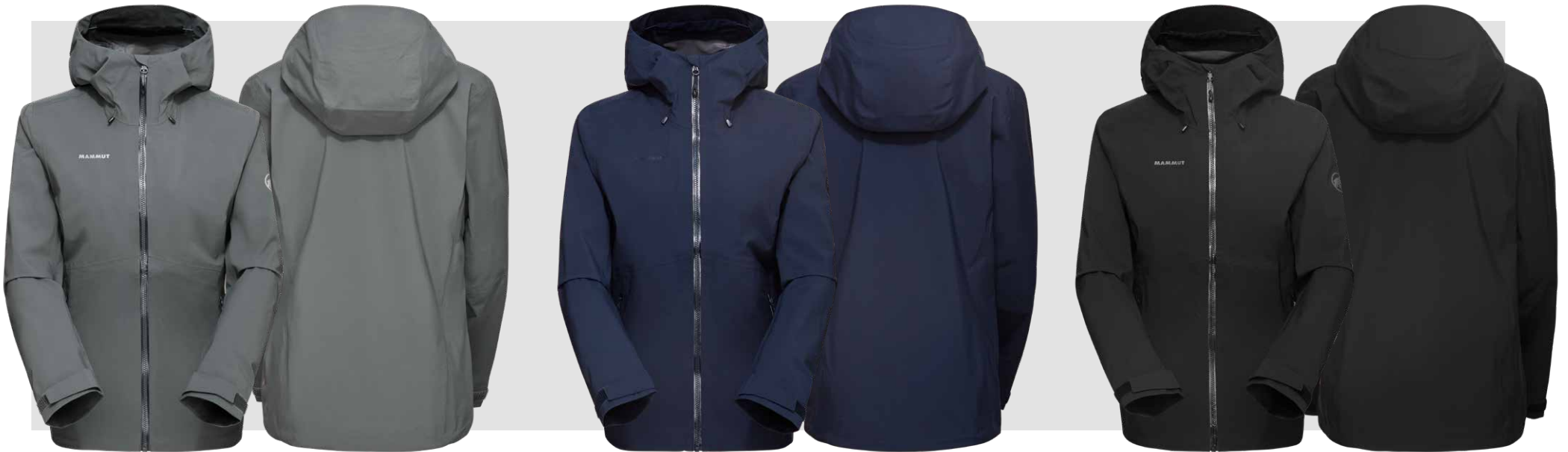
Corporate HS Hooded Jacket Women Steel 1010-30720-0226