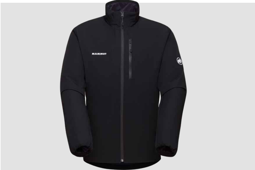
Mtn Pro 2.0 IN Jacket Men 1013-02890