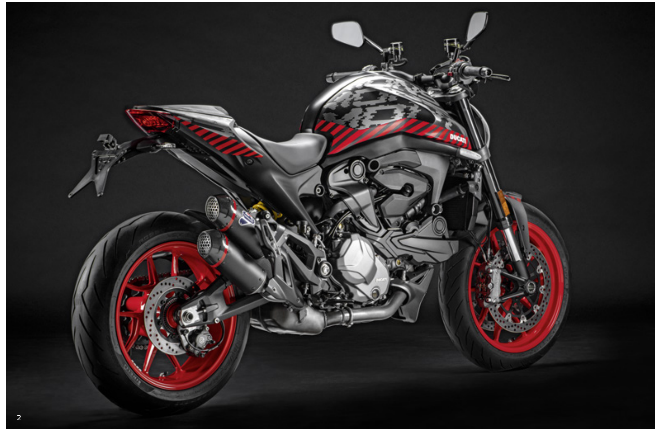
2. Pixel customisation kit Aluminium rear-view mirrors OK A Licence plate holder kit OK A