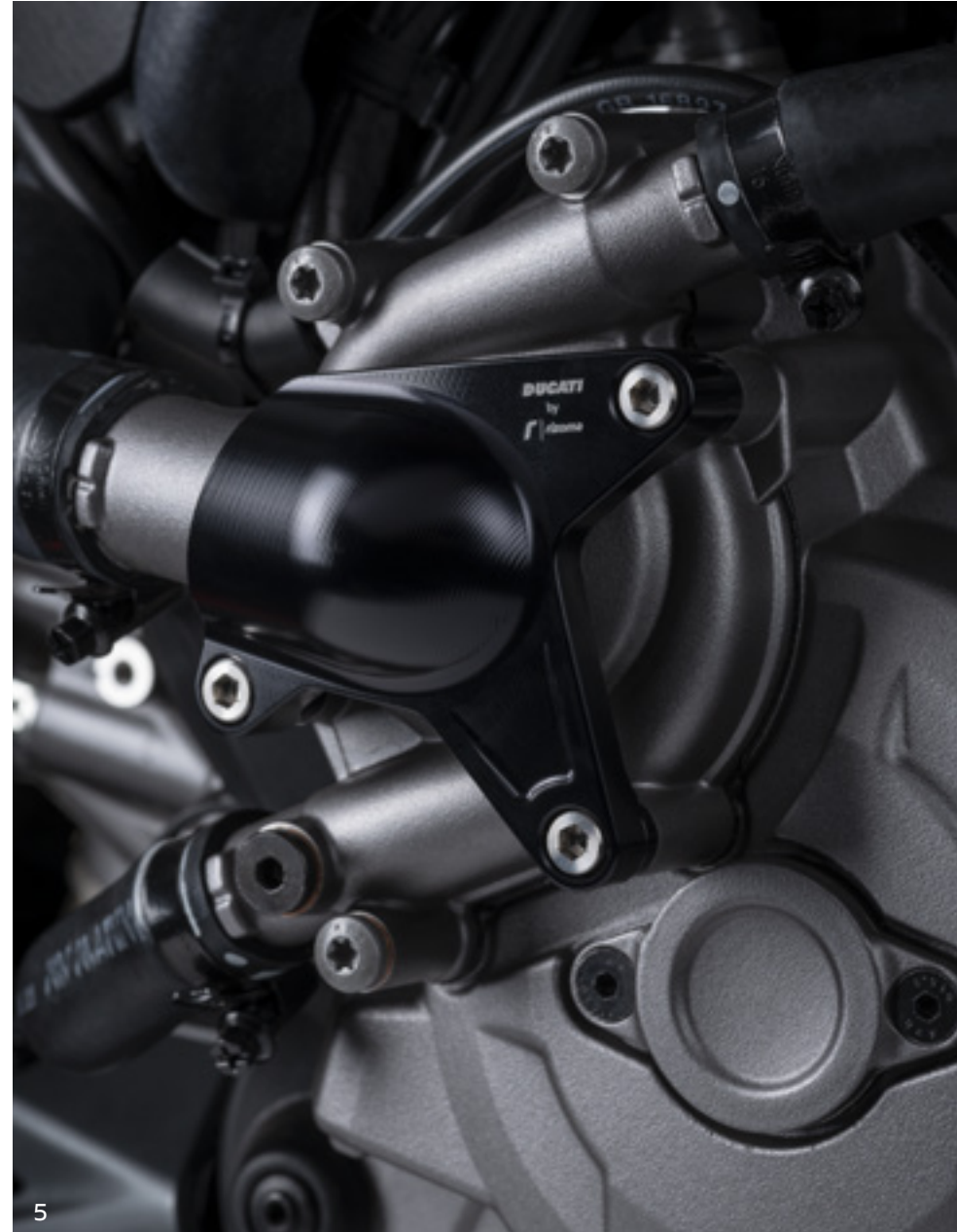
5_ Billet aluminium water pump cover. A ■