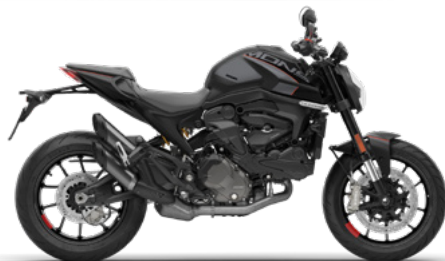
Logo decal kit