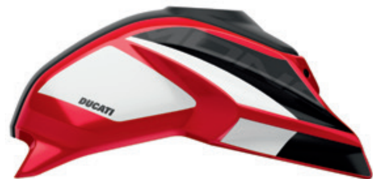
Corse decal kit