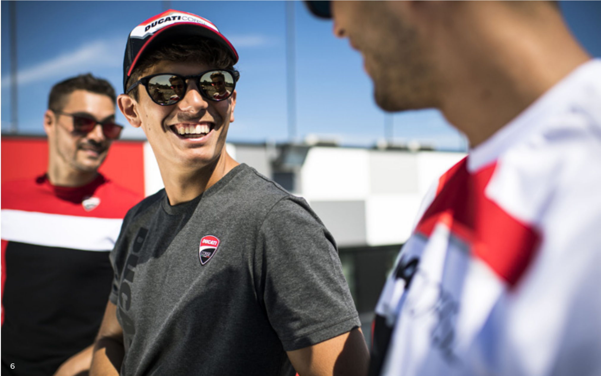
6_ Racing Spirit Cap. Acapulco Sunglasses. DC Tonal T-shirt.