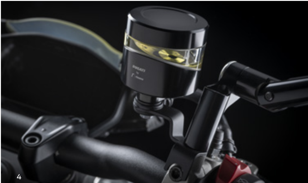
3_ LH aluminium rear-view mirror. OK A ■ ■ 4_ Brake fluid reservoir. A ■ ■