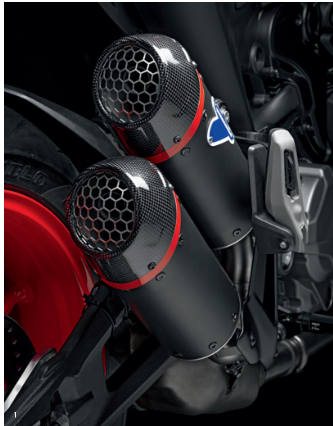
1. Silencers. OK EU5

Try the online configurator and customise your new Ducati bike at configurator.ducati.com