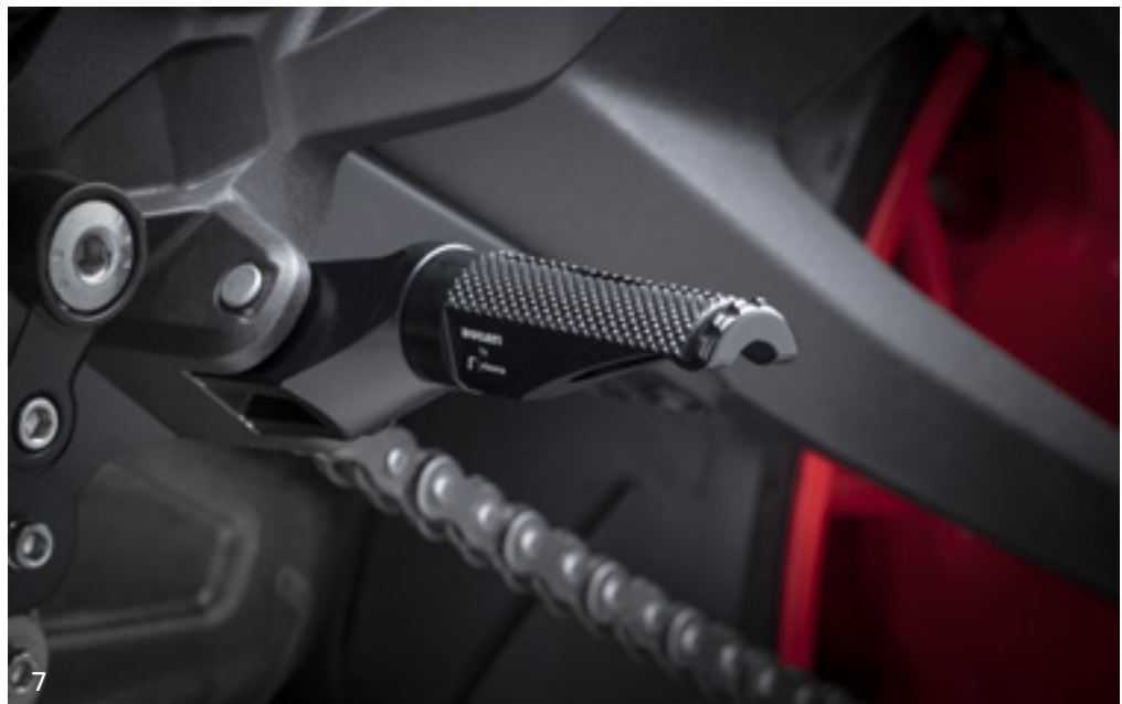
6_ Portatarga in alluminio sotto-sella. OK 7_ Billet aluminium footpegs. OK ■ ■