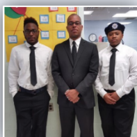
Mentoring Programs: Knights of Pythagoras Save Our-Selves In-School (#59)