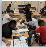
Access to College Courses