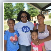
Say Yes Buffalo School-Based Preventative Services