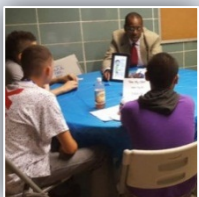
Mentoring Projects: MBK Challenge Grant & MBK Fellows