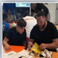
Family and Community Education Grant