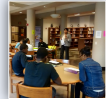
Teacher Opportunity Corp