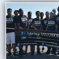
Say Yes Buffalo Boys & Men of Color Breaking Barriers Youth Leadership Council