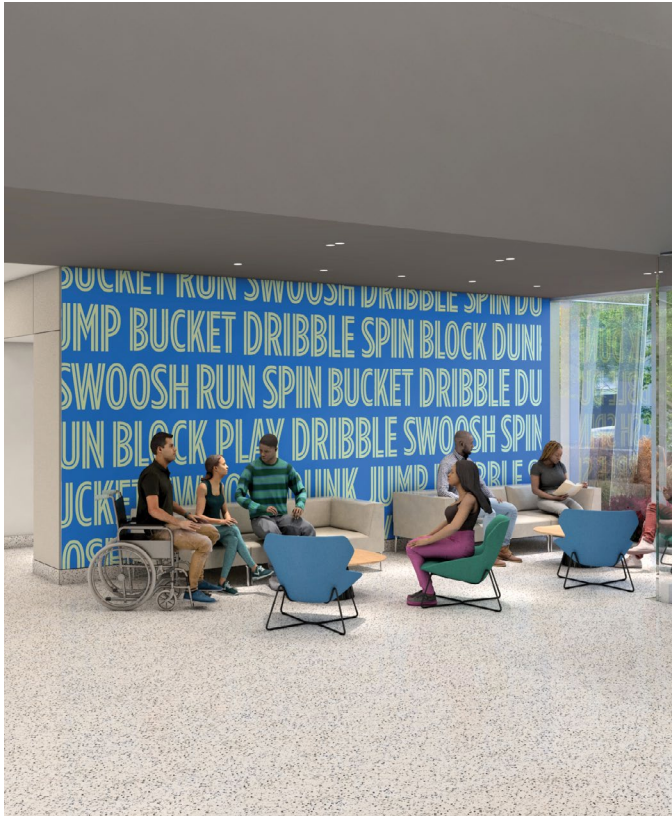
Home Court Lobby