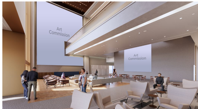
Our Story Lobby

Space availability varies by location. Please inquire for specific location details. The Museum is available for a full exclusive buyout after 5 p.m.