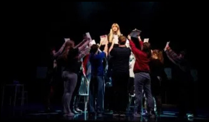
Image: Stockton Riverside College's production of SHOUT