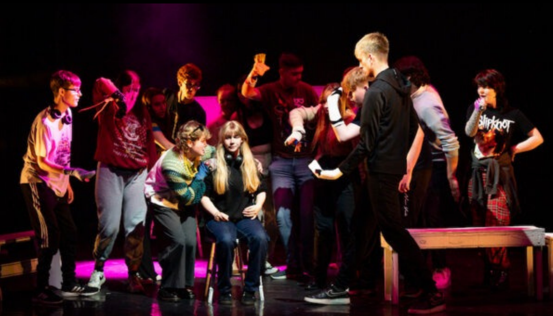
Image: Stockton Riverside College's production of SHOUT

It's not just the noise you make that makes you who you are.