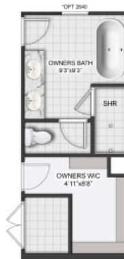
OPT LUXURY OWNERS BATH