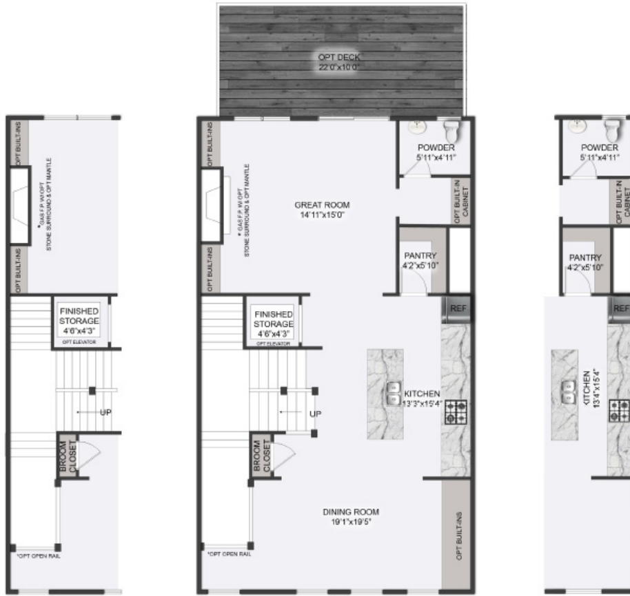
END UNIT - LEFT SIDE