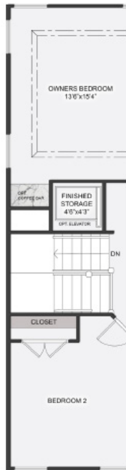
END UNIT- LEFT SIDE