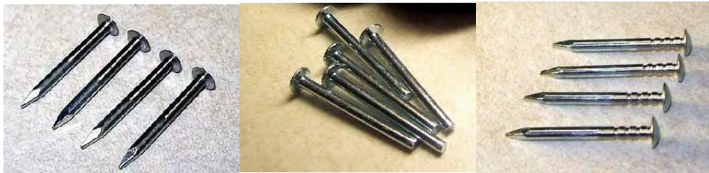
Example 8. Axles

Official BSA axles that have been polished are allowed.