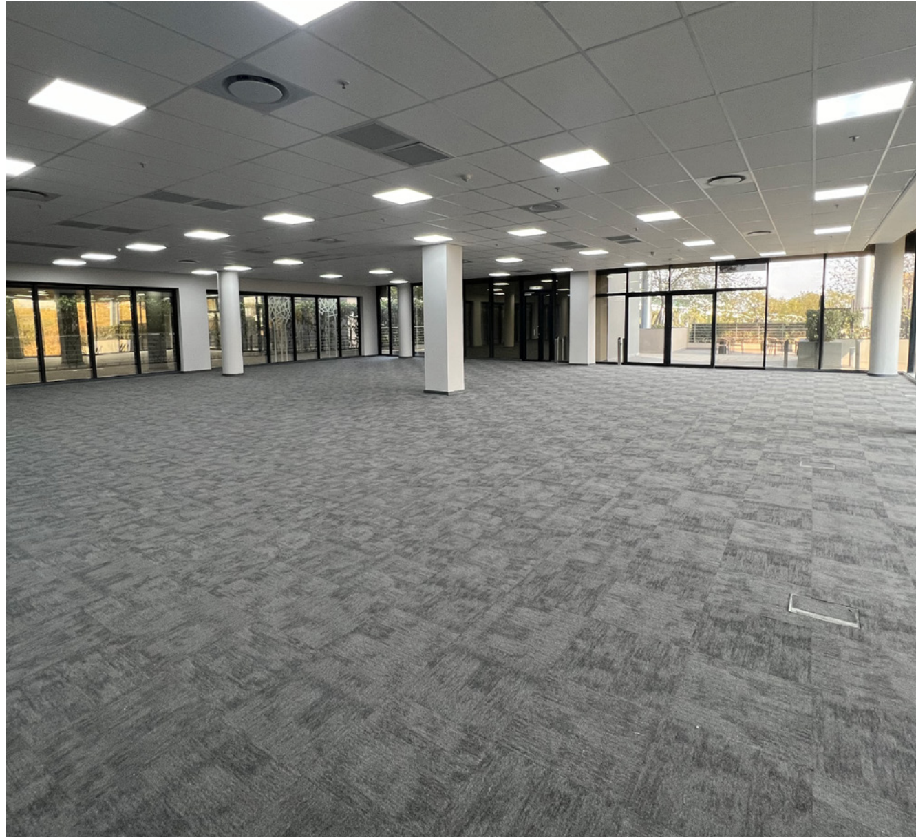
Ground Floor West | 673m 2 | Internal photo