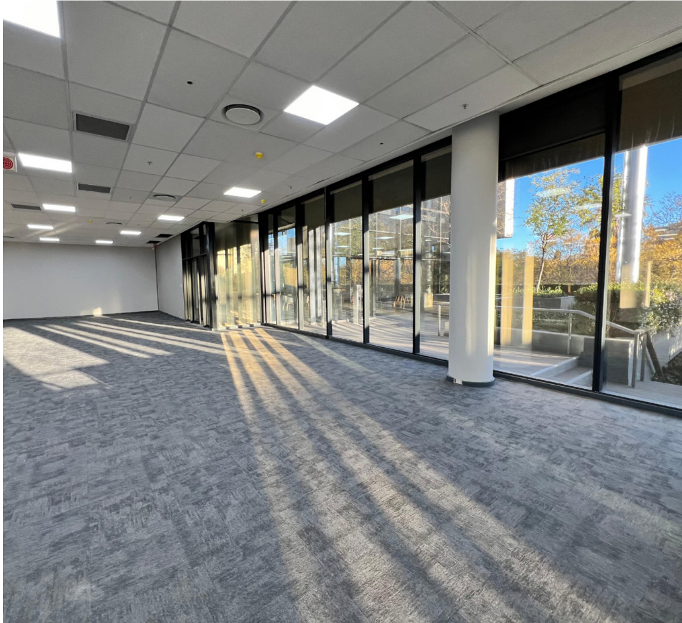
Ground Floor East | 561m 2 | Internal photo