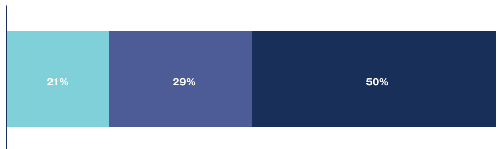
● Environmental ● Social ● Governance