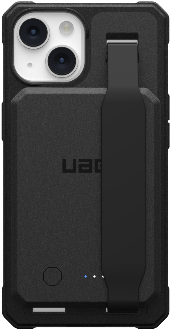
CASE SHOWN WITH BATTERY ATTACHED. SOLD SEPARATELY