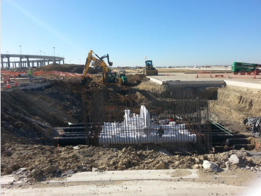
Construction of new jet fuel vault