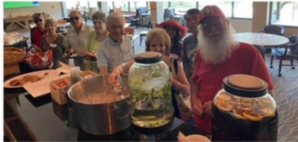
Bear Creek did a stellar job on the gourmet Hot Dogs! They were delicious! Retirees grin in agreement.