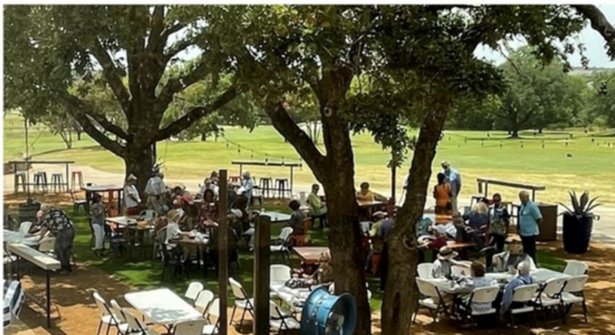
Retirees stay cool in the shade, enjoying fellowship, listening to music, and visiting. Kicking back and relaxing while reminiscing with old colleagues!