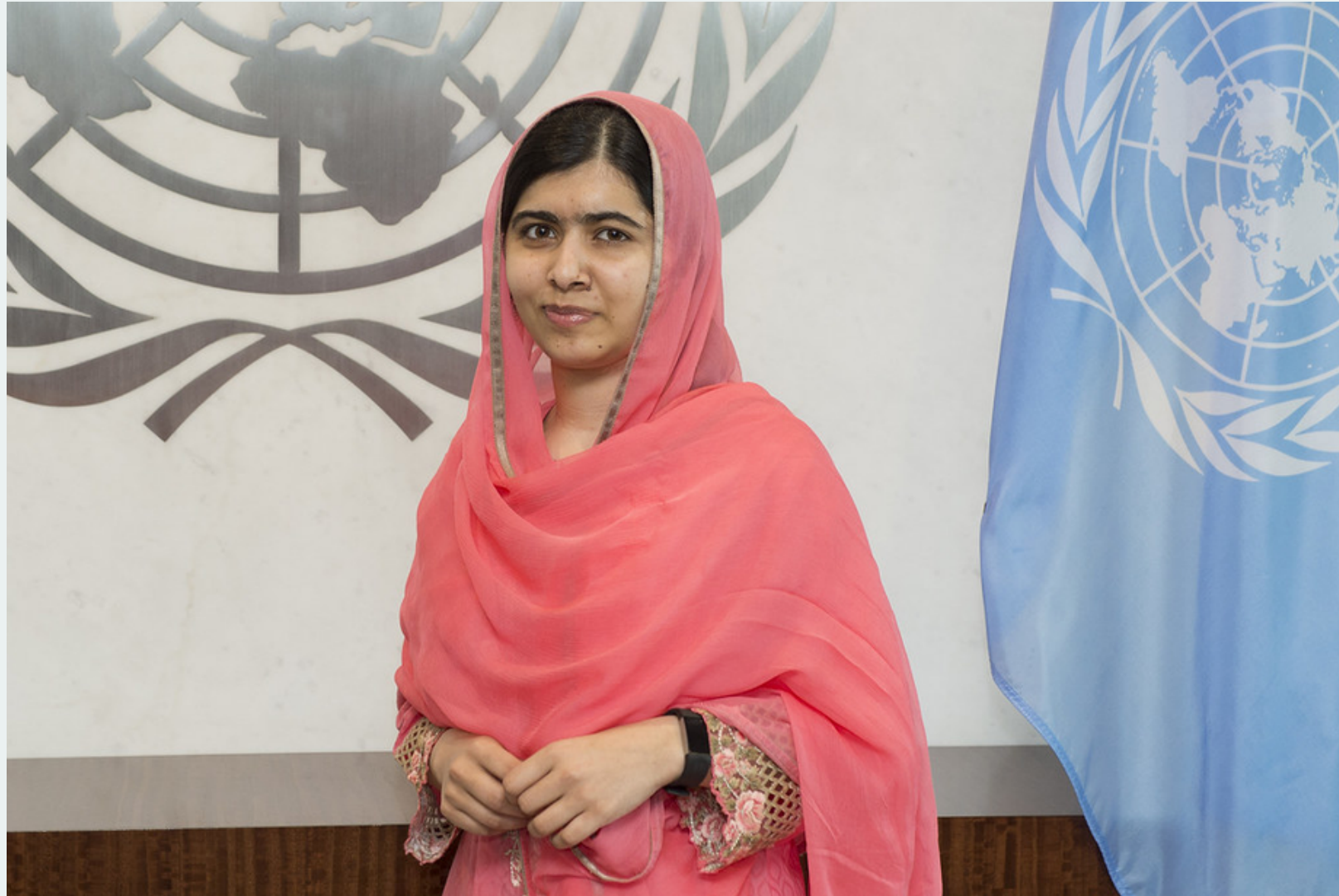
UN MESSENGER OF PEACE MALALA YOUSAFZAI

Did you know that in some countries girls are banned from going to school, or that violence like war keeps girls from accessing education? There are many other barriers that exist across countries and communities that prevent girls from progressing. According to UN Women, "every year of additional primary school increases girls' eventual wages by 10-20%. It also encourages them to marry later and have fewer children, and leaves them less vulnerable to violence".