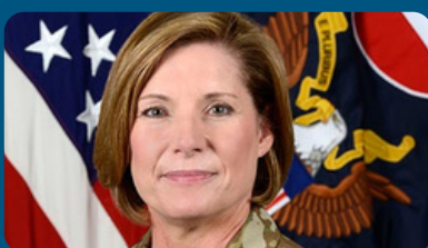
Lieutenant General Laura J. Richardson was the U.S. Army's first female division deputy commander to lead 'America's First Team.'

Choice 3: Create a career-readiness digital portfolio using Bulb or Google Slides to showcase your project and learning journey.