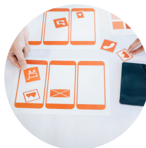
UX Design: From Idea to Launch