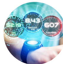
Sports Data and Analytics

The tech expeditions translate to passion projects that showcase learners' interest and enthusiasm about what real-world problem they want to solve. The Genius Hour concept started at Google, where staff could spend 20% of their time working on passion projects that they wanted to explore. Google credited this unleashing of creativity for 50% of their product lines, such as Gmail and Google News. Author Daniel Pink, the author of A Whole New Mind , also detailed how companies successfully implemented Google-time projects.