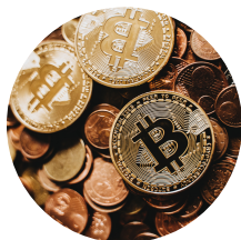
Cryptocurrency & Blockchain

Exercise voice and choice in their learning by embarking on a self-selected expedition to demonstrate their content mastery and skills by transferring their knowledge to create a tangible product.