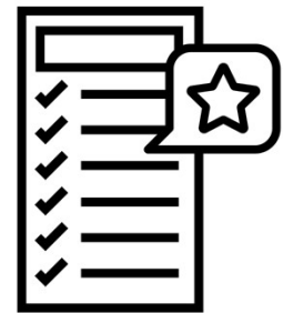
WBL Skills Feedback Survey Future Ready Skills Assessment