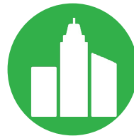
HOSPITALITY & TOURISM