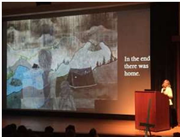
MOCA + Story Exchange, Mindful: Exploring Mental Health Through Art March 2017