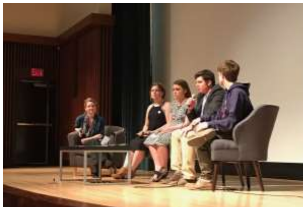
A Mindful Night: Youth Panel Discussion + Pop-up Exhibition April 2017