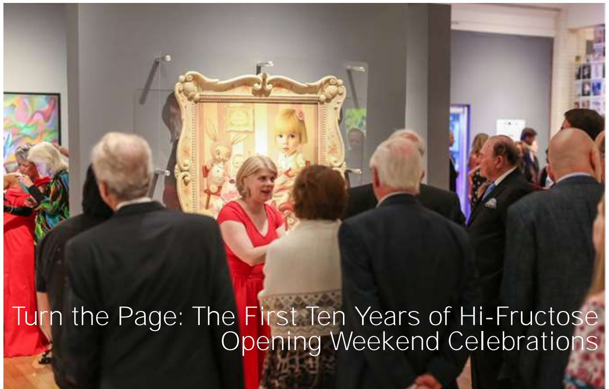
Turn the Page: The First Ten Years of Hi-Fructose Opening Weekend Celebrations