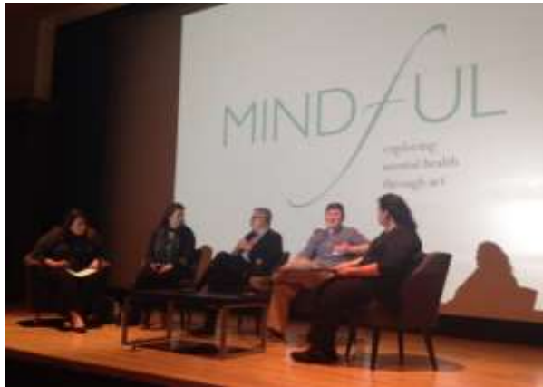
Mindful Panel Discussion + Community Resource Night February 2017