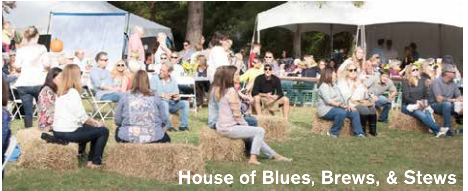
House of Blues, Brews, & Stews