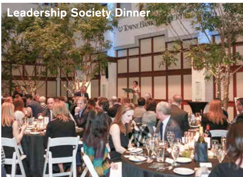
Leadership Society Dinner