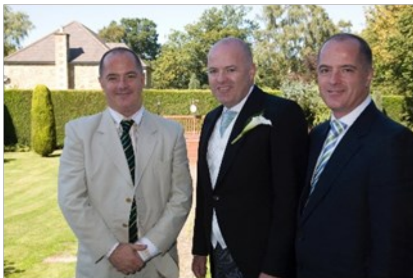
Here they are at Chris' daughter's wedding