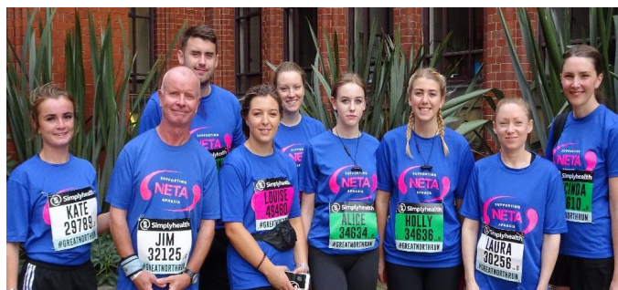
Some of our fantastic runners