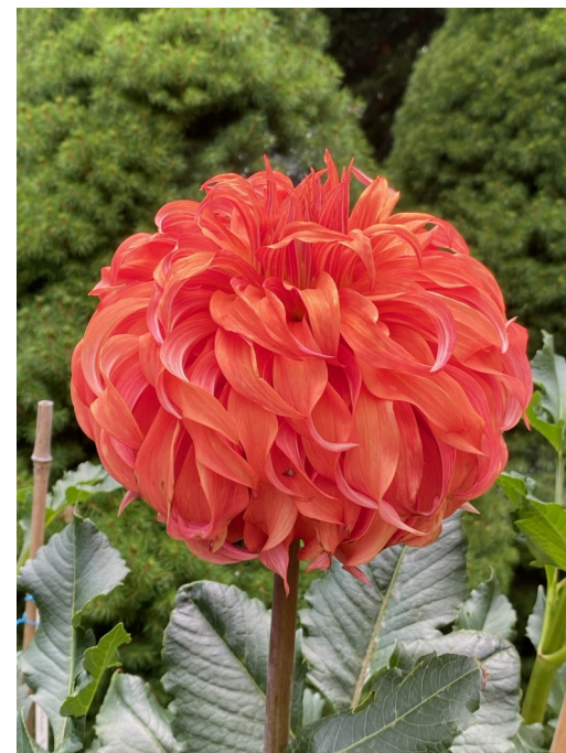
Show Flower "Bloomquest Jean"