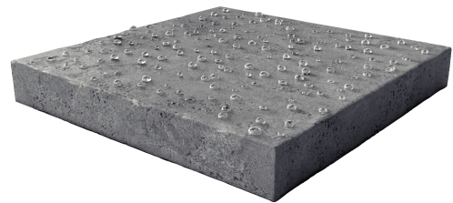
Ghostshield dries completely clear protecting the concrete from surface damage