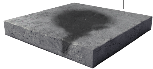
Water-Soluble Deleterious Materials & Chlorides Repelled By Ghostshield