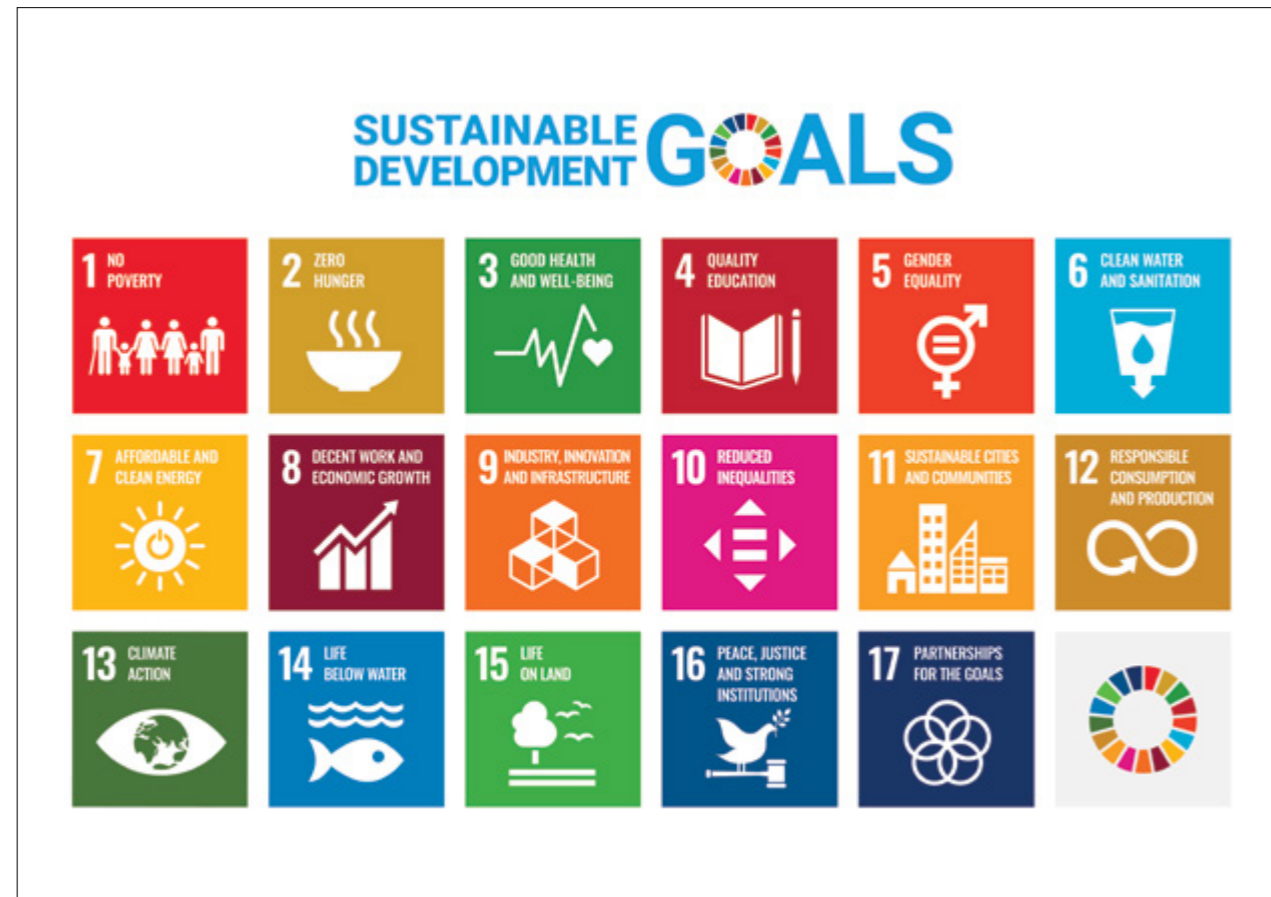
Figure 1 The global goals

The SDGs form the foundation for MCEC's Sustainability Strategy, which contributes to 14 of the 17 SDGs and aligns our business accordingly. The goals and targets included in this strategy reflect the most urgent and pertinent goals that we believe we can contribute towards within the lifetime of this Strategy. As the next iteration of our Sustainability Strategy is developed, there will be scope to include more SDGs and further improve our progress.