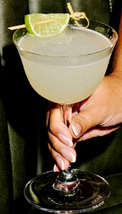
Yuzu Gimlet Four Pillars Yuzu Gin, Yuzu juice and simple syrup

Malibu, rose extract, milk and rose petals