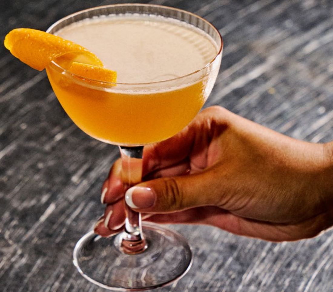
Sidecar Hennessy Cognac VS, Triple Sec, lemon juice and simple syrup with an orange twist

Add your favourite cocktails to the mix and turn it into a party like no other.