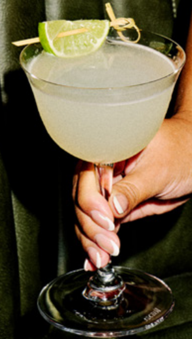
Yuzu Gimlet Four Pillars Yuzu Gin, Yuzu juice and simple syrup

Malibu, rose extract, milk and rose petals