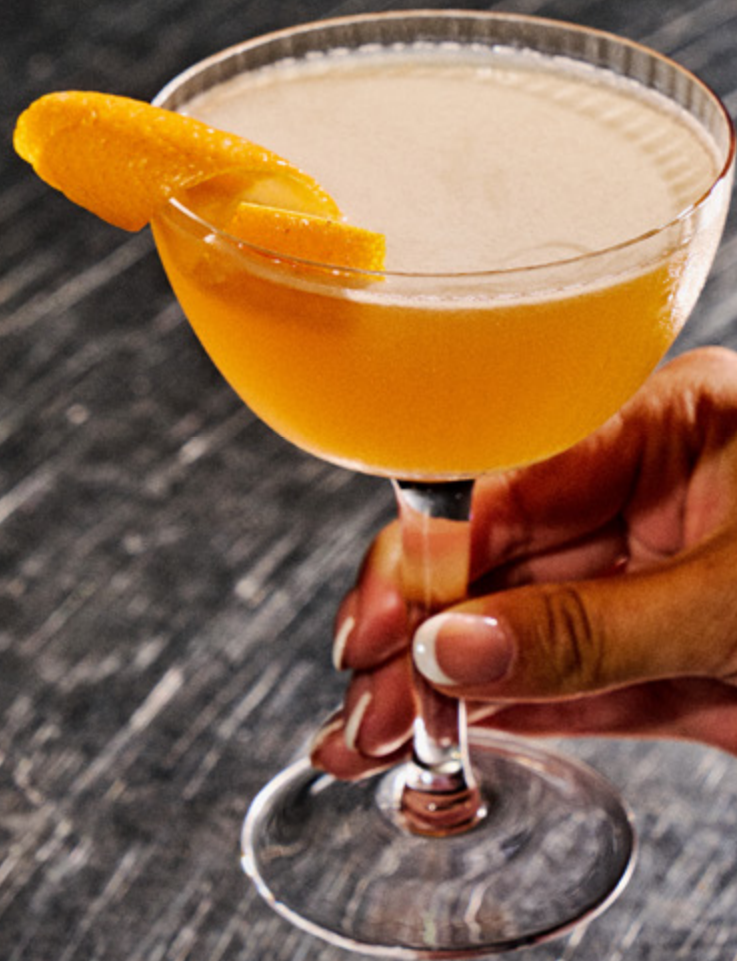
Sidecar Hennessy Cognac VS, Triple Sec, lemon juice and simple syrup with an orange twist

Add your favourite cocktails to the mix and turn it into a party like no other.