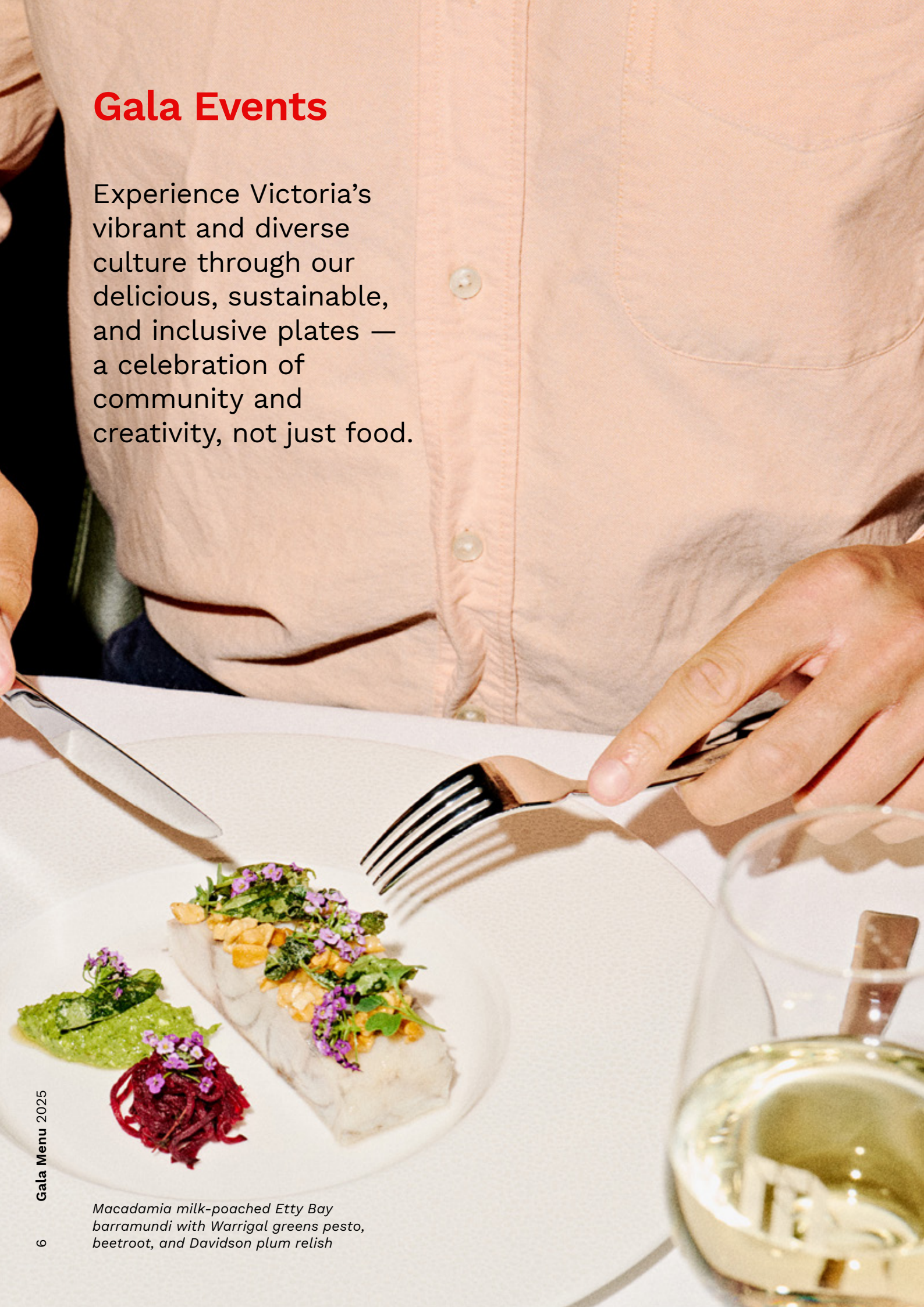
Macadamia milk-poached Etty Bay barramundi with Warrigal greens pesto, beetroot, and Davidson plum relish

Experience Victoria's vibrant and diverse culture through our delicious, sustainable, and inclusive plates — a celebration of community and creativity, not just food.