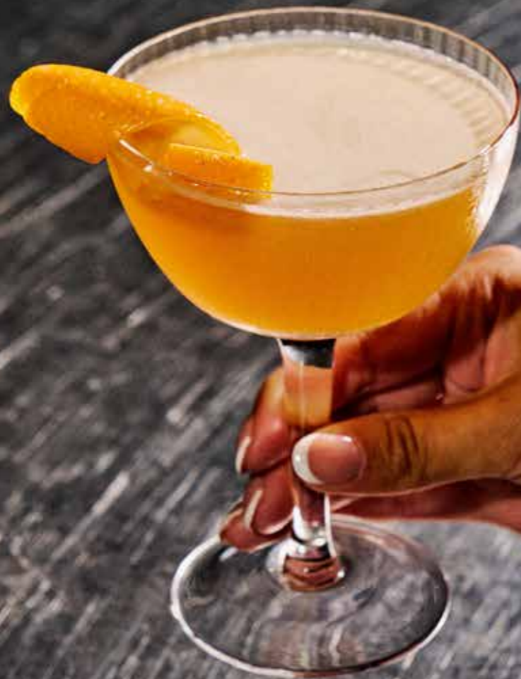
Sidecar Hennessy Cognac VS, Triple Sec, lemon juice and simple syrup with an orange twist

Add your favourite cocktails to the mix and turn it into a party like no other.