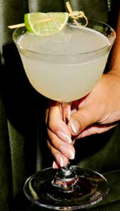
Yuzu Gimlet Four Pillars Yuzu Gin, Yuzu juice and simple syrup

Malibu, rose extract, milk and rose petals