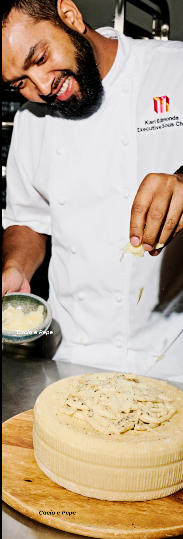
Cacio e Pepe

Set the vibe for your multi-day conference with a Melbourne-inspired package that knows how to make an entrance. Enjoy two hours of our city's diverse flavours and sips to spark excitement and get everyone talking and tasting!