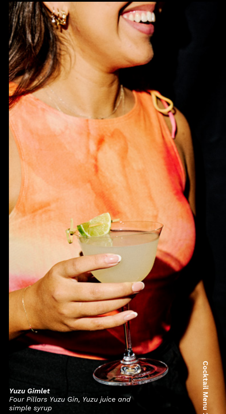
Yuzu Gimlet Four Pillars Yuzu Gin, Yuzu juice and simple syrup

Malibu, rose extract, milk and rose petals