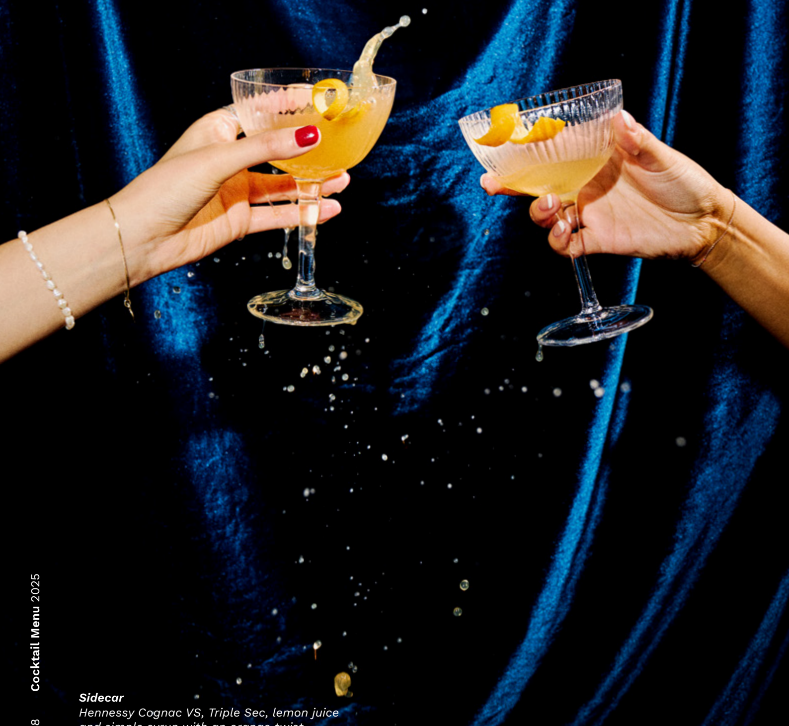
Sidecar Hennessy Cognac VS, Triple Sec, lemon juice and simple syrup with an orange twist

Add your favourite cocktails to the mix and turn it into a party like no other.