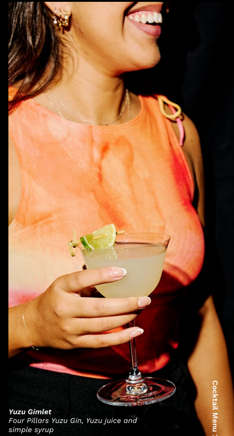
Yuzu Gimlet Four Pillars Yuzu Gin, Yuzu juice and simple syrup

Malibu, rose extract, milk and rose petals