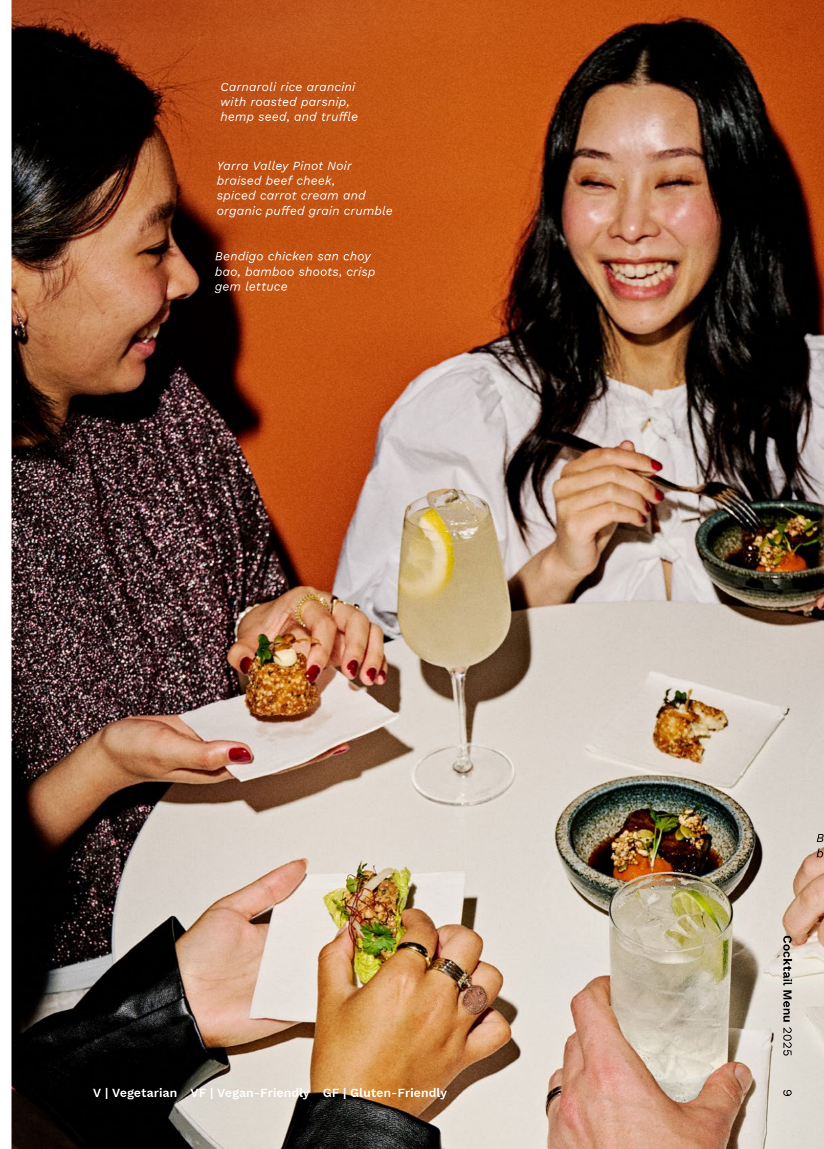
Carnaroli rice arancini with roasted parsnip, hemp seed, and truffle