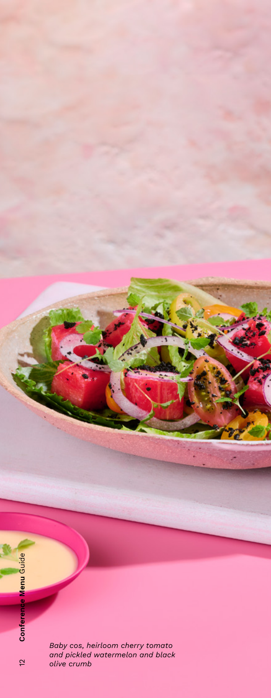
Baby cos, heirloom cherry tomato and pickled watermelon and black olive crumb