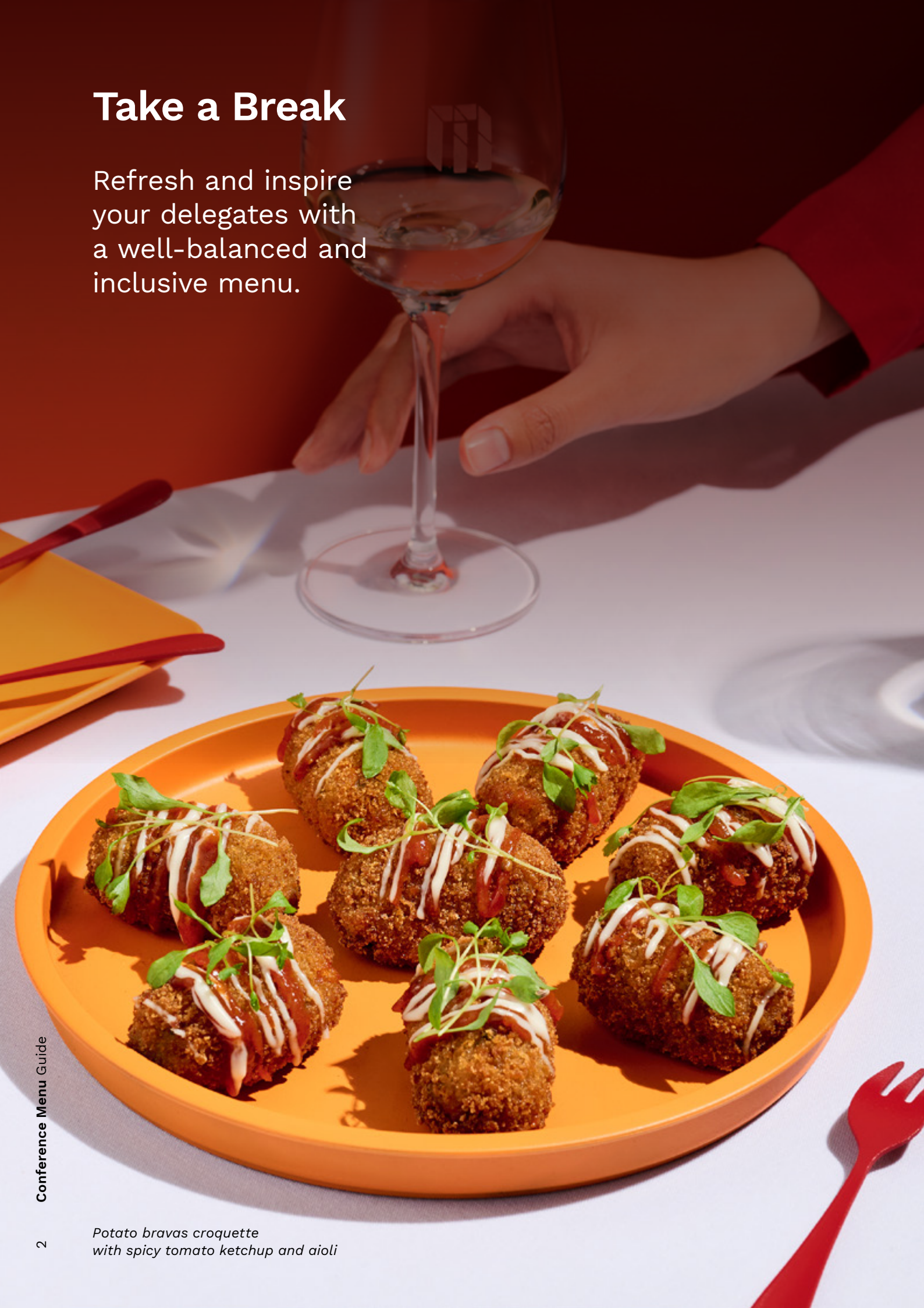
Potato bravas croquette with spicy tomato ketchup and aioli

Refresh and inspire your delegates with a well-balanced and inclusive menu.