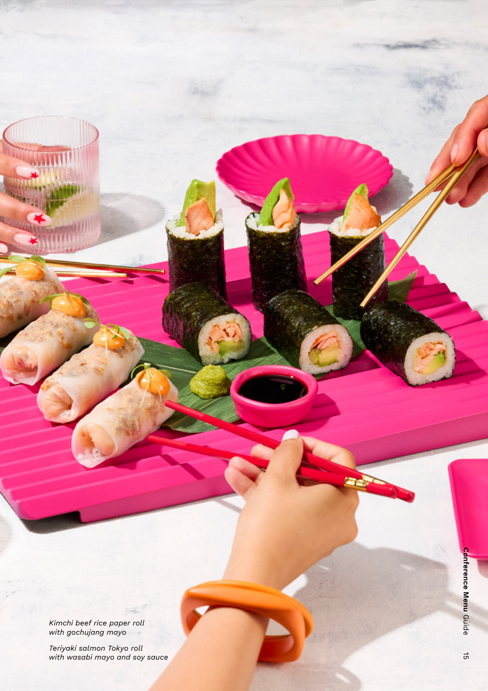
Kimchi beef rice paper roll with gochujang mayo