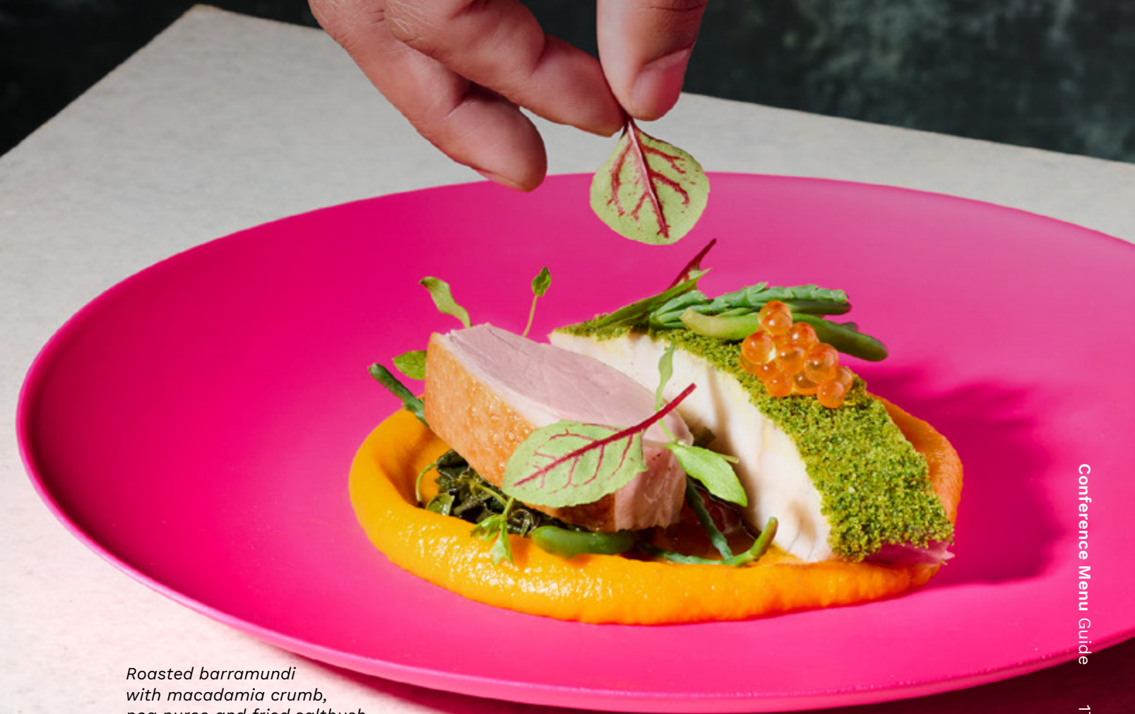
Roasted barramundi with macadamia crumb, pea puree and fried saltbush

Make connecting and building relationships easy for your delegates.