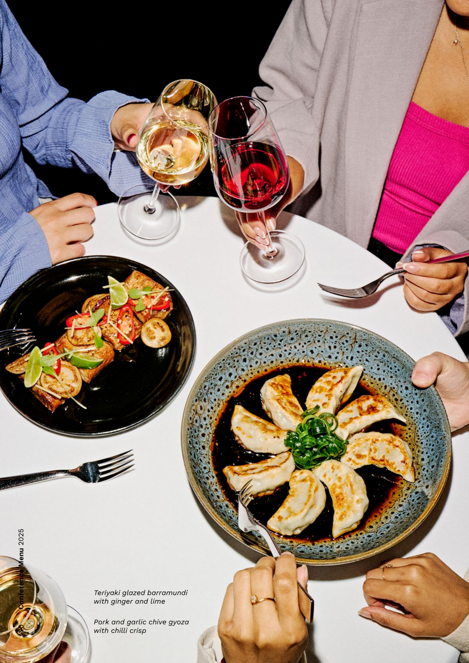
Teriyaki glazed barramundi with ginger and lime