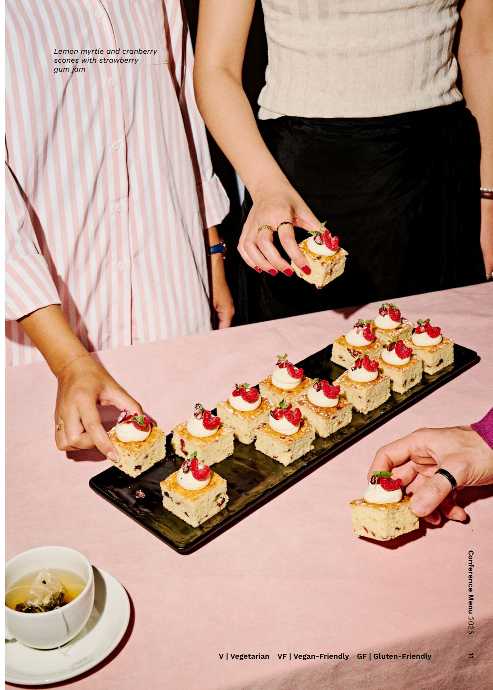
Lemon myrtle and cranberry scones with strawberry gum jam