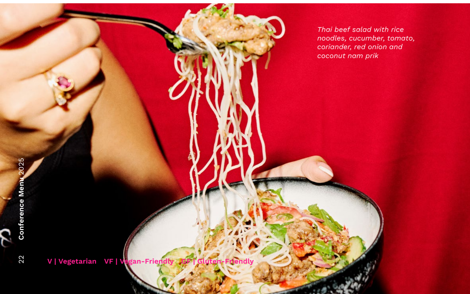
Thai beef salad with rice noodles, cucumber, tomato, coriander, red onion and coconut nam prik