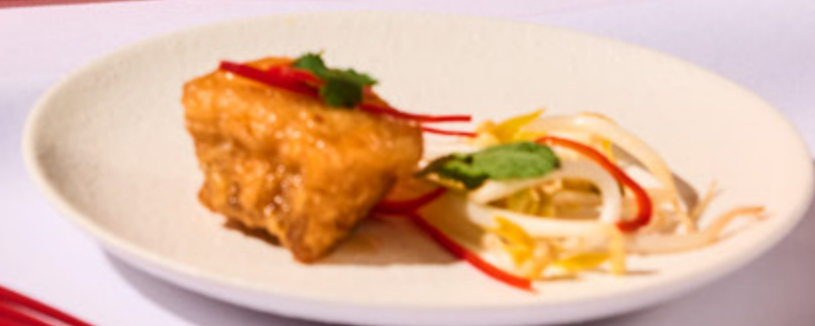
Chilli caramel pork belly bites with beans shoots and fragrant herbs