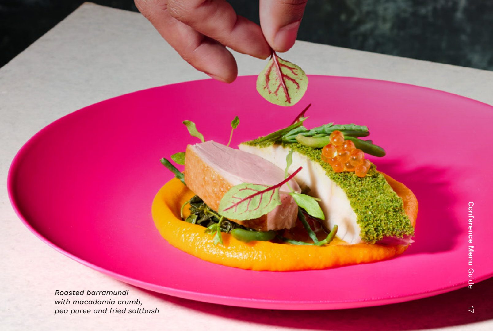
Roasted barramundi with macadamia crumb, pea puree and fried saltbush

Make connecting and building relationships easy for your delegates.